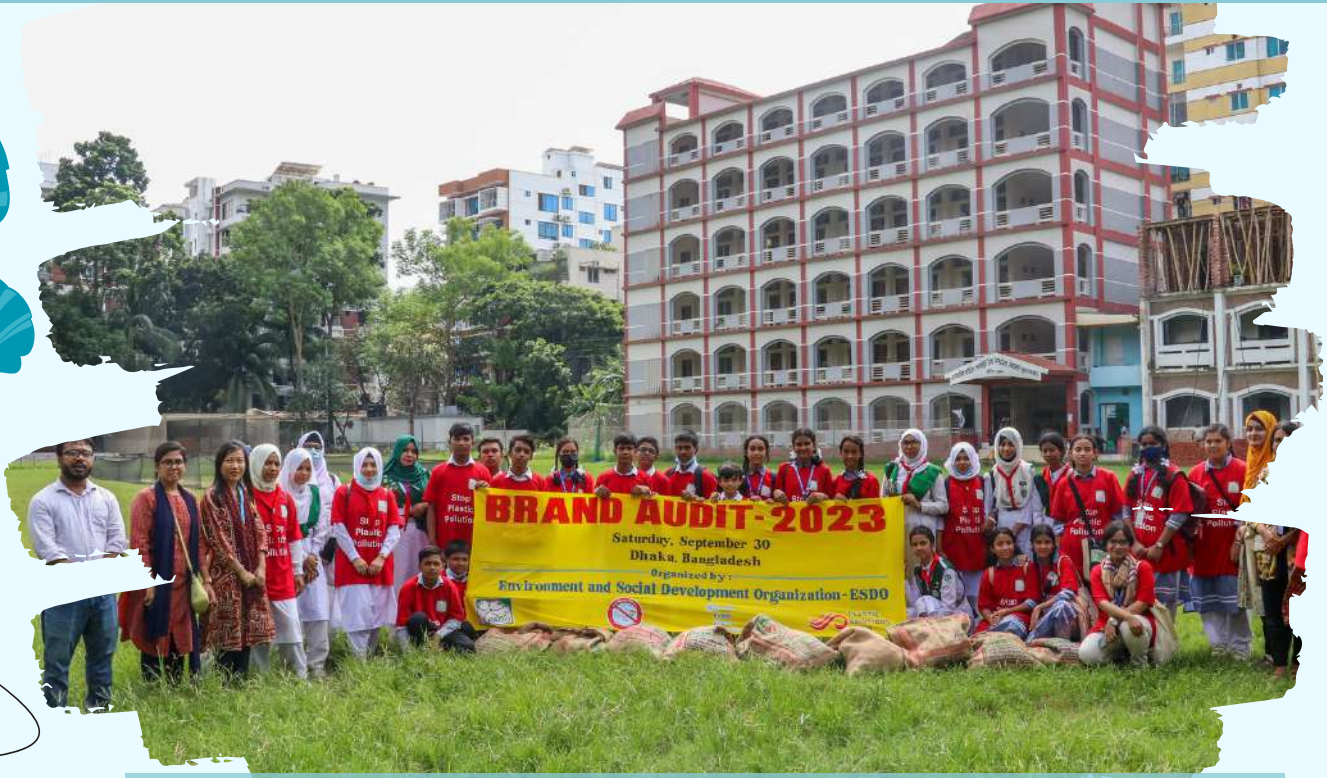
Fig-15: Brand Audit of single-use plastic-2023

Brand Audit of single-use plastic pollution -2023 was organized by Environment and Social Development Organization - ESDO in partnership with BFFP (Break Free from Plastic). The primary purpose of the brand audit is to identify and quantify the single-use plastic waste generated by specific brands.