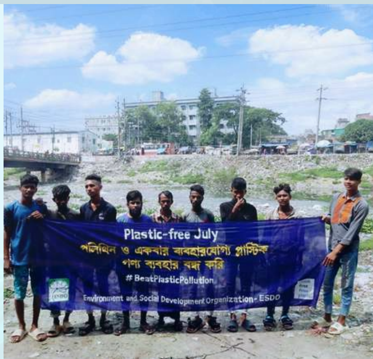
Fig-13: ESDO's initiative to combat plastic pollution