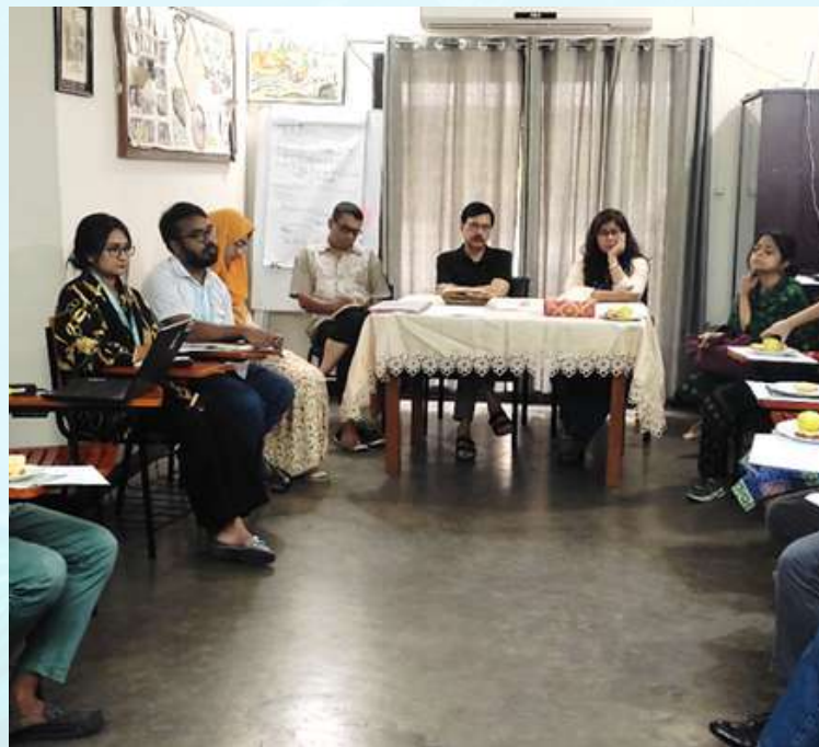
Fig-14: SME Consultation