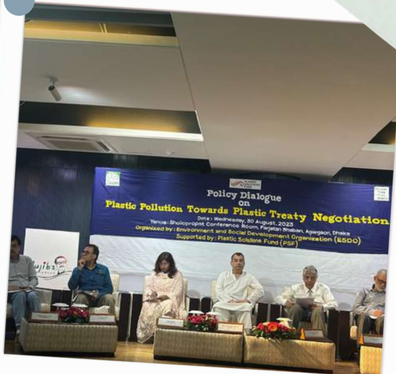
Fig-12: Policy Dialogue on plastic pollution