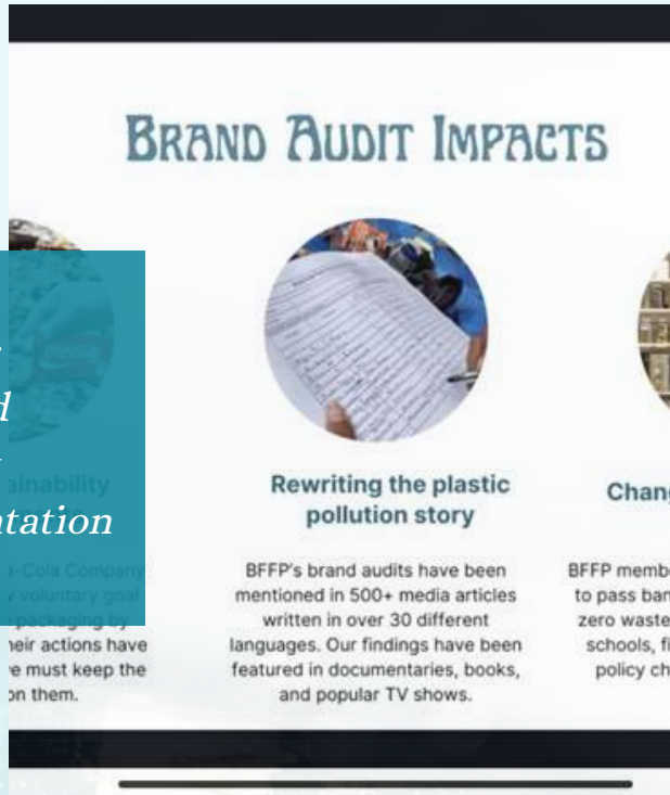
Fig-8: Brand Audit Orientation