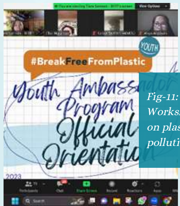
Fig-11: Workshop on plastic pollution

The Break Free From Plastic (BFFP) Youth Ambassador Program is a capacity-building and networking program that equips young people with the means to start campaigns against plastic pollution both at home and abroad. Through this youth ambassador program, BFFP focuses on three objectives; capacity building to have an in-depth understanding of the plastic issue, networking to showcase own works and meet other young leaders, and leadership & collaboration, specifically cross-cultural collaboration.