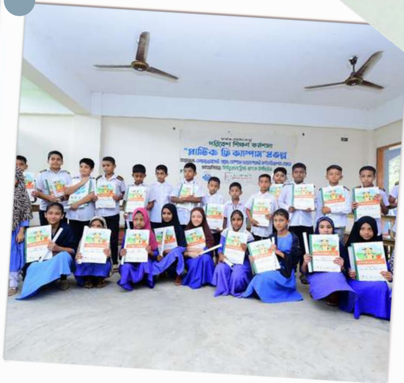
Fig-2: Plastic-free Campus Intervention in Sylhet