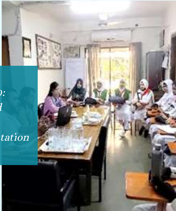
Fig-10: Brand Audit Orientation

Environment Social and Development Organization (ESDO) organized a volunteer orientation for a Brand Audit of single-use plastic in Dhaka and Rangpur cities in 26th and 27th September of 2023. This event aimed to raise awareness among local people about the environmental impact of single-use plastics. The aim of these orientation to share ideas about plastic pollution and how to participated in the brand audit event.