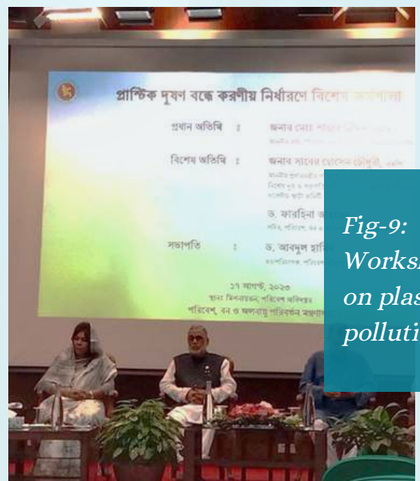
Fig-9: Workshop on plastic pollution

Department of Environment. Ministry of Environment. Forest and Climate Change organized a workshop to discuss plastic pollution in the country on 17 August 2023 at 09:30 am at the auditorium (2nd Floor) of the Department of Environment. The workshop participants were divided into five breaking groups. Each group was given a thematic topic to discuss and present it to the audience. Finding Avenue to promote circular economy in plastic sector, and Enforcement operation to combat the indiscriminate manufacturing and marketing of polyethylene.