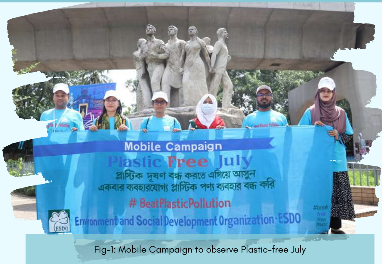
Fig-1: Mobile Campaign to observe Plastic-free July

To observe the Plastic-free July, a day-long mobile campaign was Environment and Social Development Organization- ESDO on July 8, 2023, in various locations in Dhaka city. An engaging message of “Combat plastic pollution” was successfully disseminated across this mobile campaign to increase awareness of the urgent need to stop plastic pollution. ESDO conducted this mobile campaign to spread knowledge about the hazards of plastic, enlighten people about the global plastic treaty, and rally support for initiatives to halt plastic pollution. At 9.30 am, the campaign kicked off at TSC, University of Dhaka.