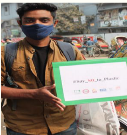
Youth Involvement during the campaign