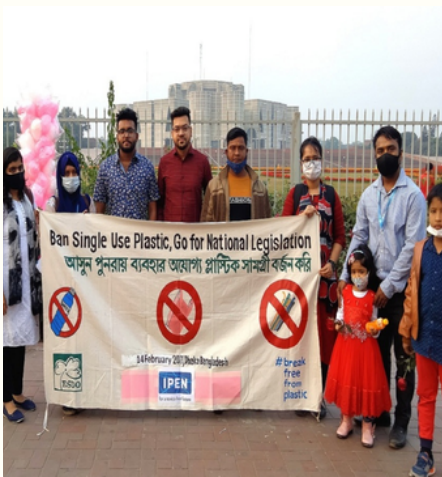
Mobile Campaign in front of National Parliament